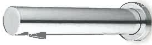
ELECTRONIC TOUCH-FREE TAP LED

4.2 Toilet flush unit must be a manual single flush system similar to the picture below