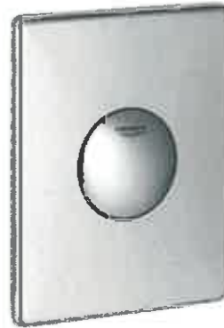
MANUAL TOILET SINGLE FLUSH PLATE

4.3 Splashback tiles must be A-Grade radiant feature ceramic similar to the picture below: